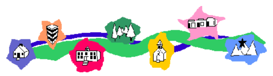
"A greenway is a corridor of protected open space managed for conservation, recreation and non-motorized transportation."

For more information, visit the website at www.indygreenways.org or contact the Registrar at (317) 237-9348.